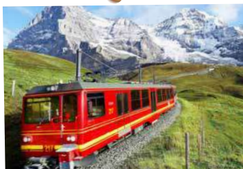
少女峰 / Jungfrauoch