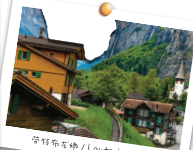
劳特布龙嫩 / Lauterbrunnen