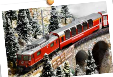
伯尔尼纳快车 / Bernina Express Train